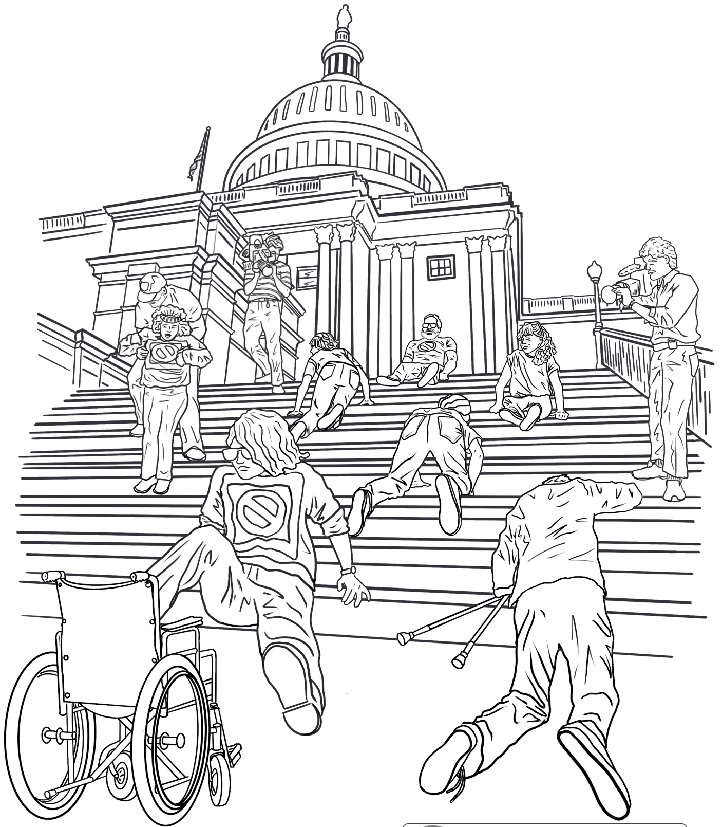
Capitol Crawl for the ADA Washington, D.C., 1990