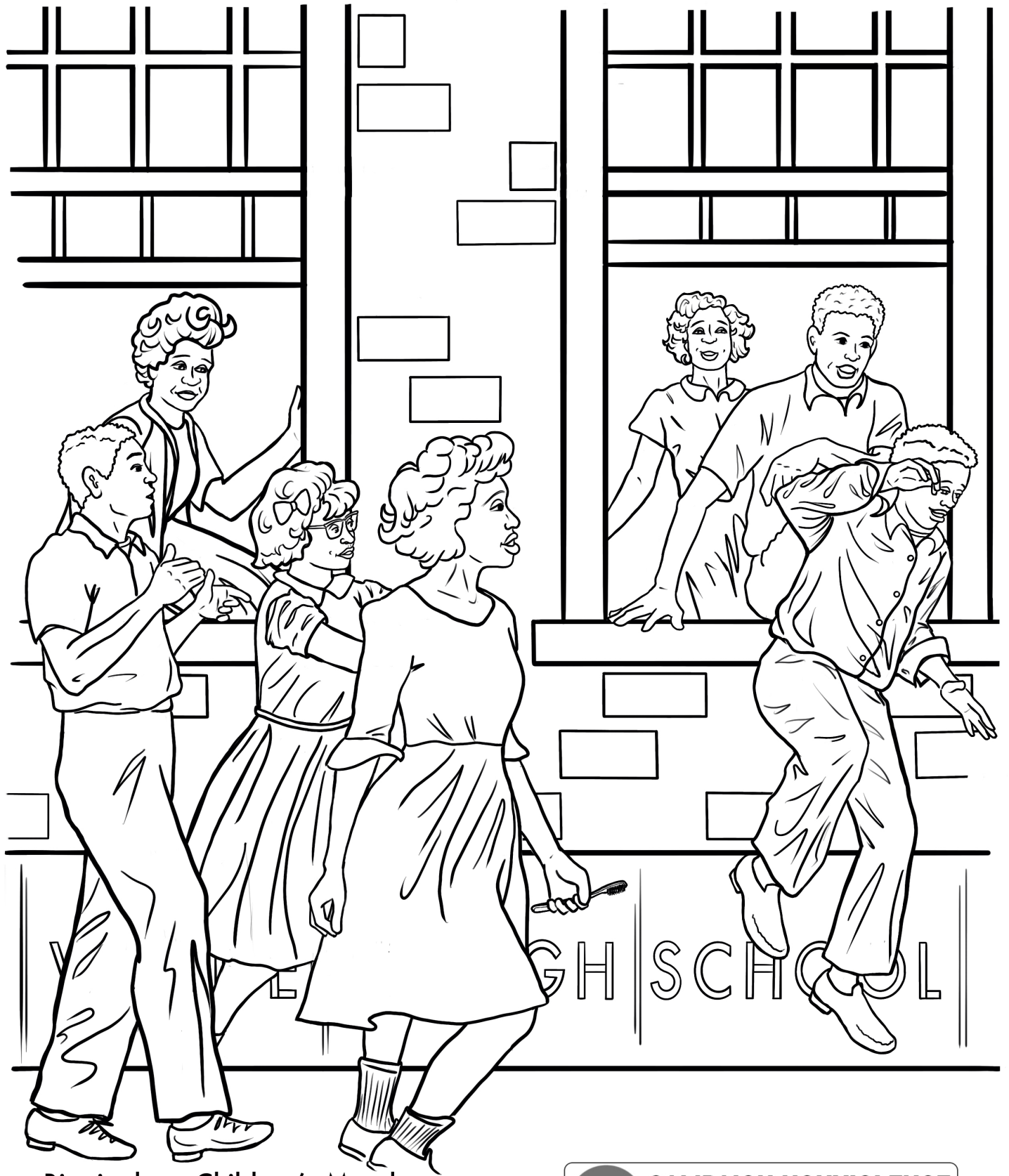
Birmingham Children's March Birmingham, Alabama, 1963